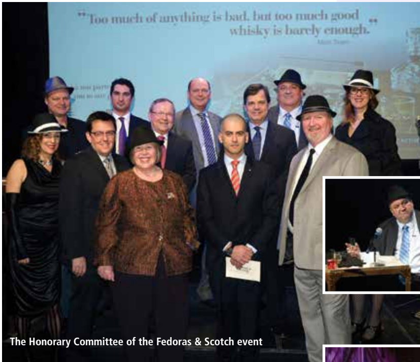
The Honorary Committee of the Fedoras & Scotch event