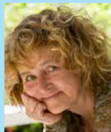
Marie-Louise Gay Marraine d'honneur du Festival des enfants TD-Metropolis bleu

8,259 people took part in an activity at the Children's Festival